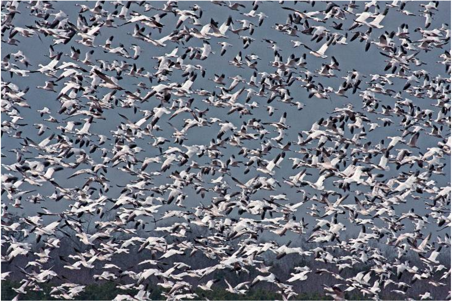
Pocosin Lakes NWR, Pungo Unit, Snow Geese in flight.